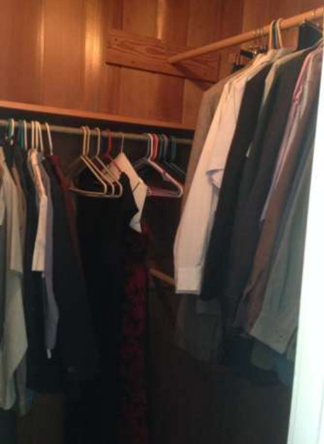
The walk-in closet is lined with red cedar.