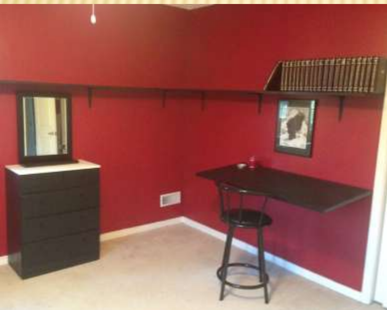
Our daughter's bedroom features a built-in desk and considerable shelf space.