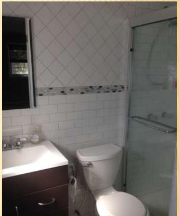
The master bathroom was renovated in 2013.